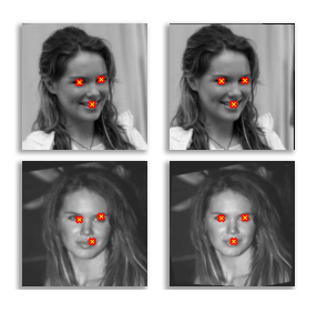
Fig. 1. Two images aligned using the Funneling technique of [28] (on the left) and the fiducial-point based alignment system. Misalignments on the left hand pair are visible when comparing the positions of the mouth and the eyes to the markers. These misalignments are all but removed in the right hand pair.

designed by Nowak and Jurie [27] on our own aligned version of the LFW image set. Originally, the LFW images were aligned using the "Funneling" technique of [28]. On this funneled set, Nowak and Jurie obtained a recognition rate of 0.7393. The same method obtains a recognition score of 0.7912 on our aligned set. Note that this performance boost was gained even tough the method of [27] has build-in mechanisms to deal with misalignments.