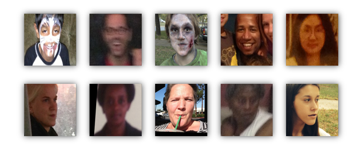
Fig. 5: Gender classification errors made by our full system on the Adience benchmark. Using LBP+FPLBP, alignment and dropout of 50%. Top row are males classified as females. Bottom are females classified as males.

our Adience set is labeled for identity. Though not used here, this information allows the it to be used as a more challenging alternative to the benchmarks used today, consequently providing a new driving force in improving face recognition capabilities beyond their present state.